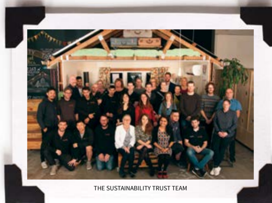
THE SUSTAINABILITY TRUST TEAM